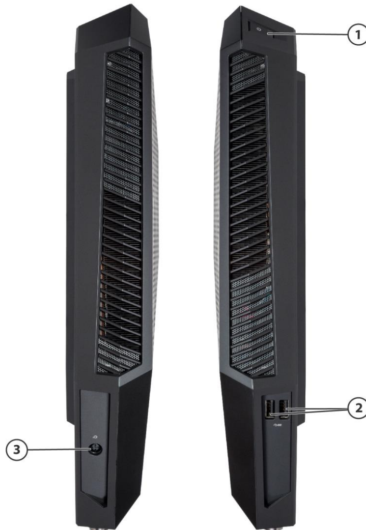
HP Z VR Backpack G1, left side and right side view